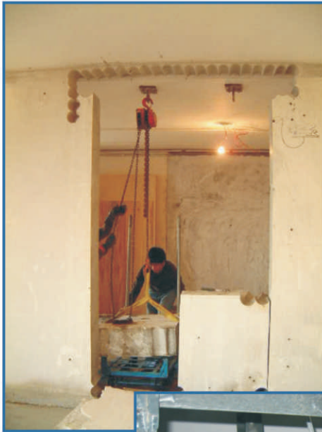
Isolated wall being taken away by drilling and cutting 已鑽孔及切割 之牆身被吊走

先進及專業的鑽孔技術，除了可將噪音及滋擾程度減至最低外，更可精確地鑽取所需尺寸，且快捷妥當，絕無後顧之憂。